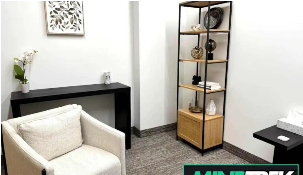
Access therapy centre oshawa