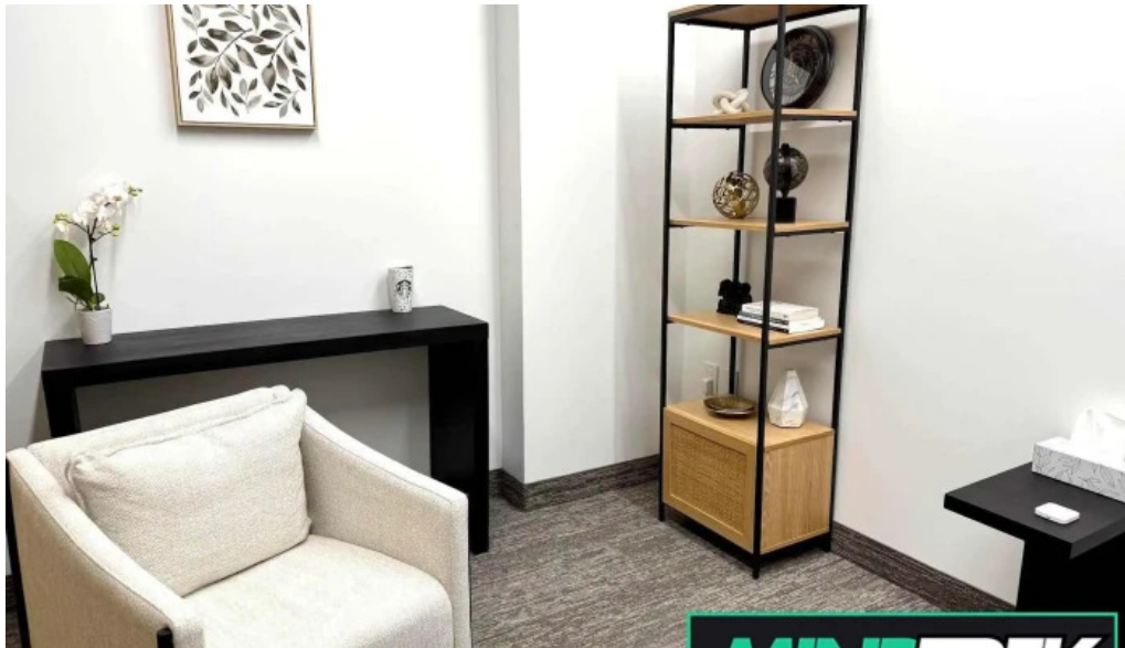
Access therapy centre all