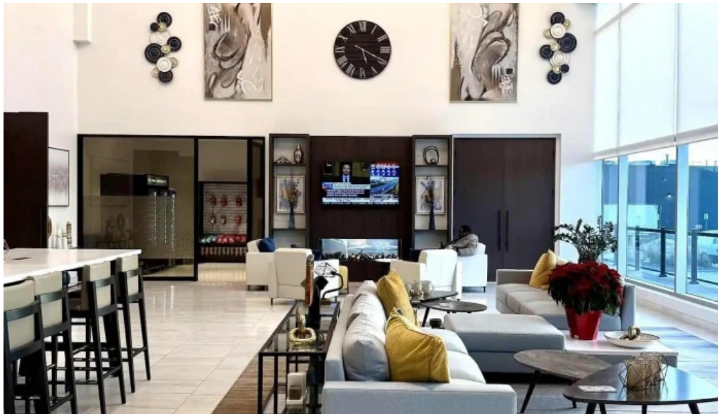
Access therapy centre by owner