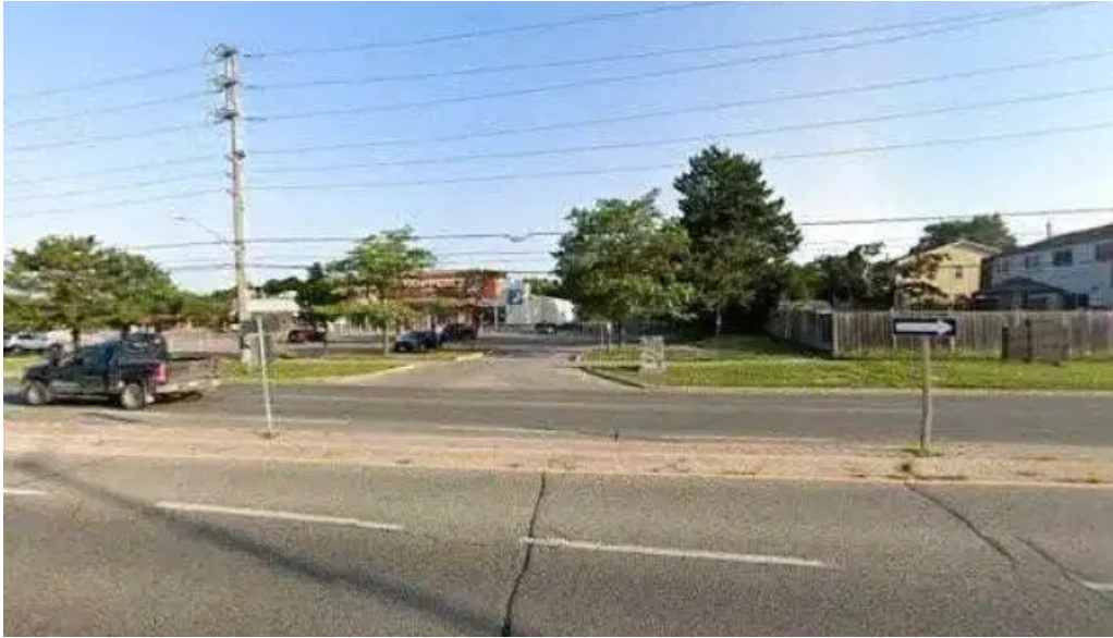
Access therapy centre street view 360deg