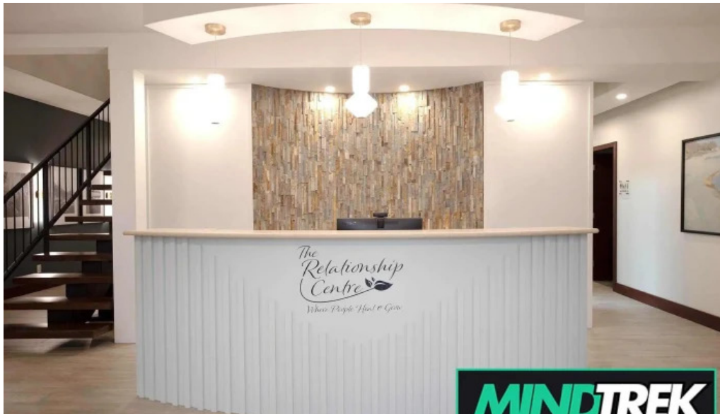
The relationship centre all