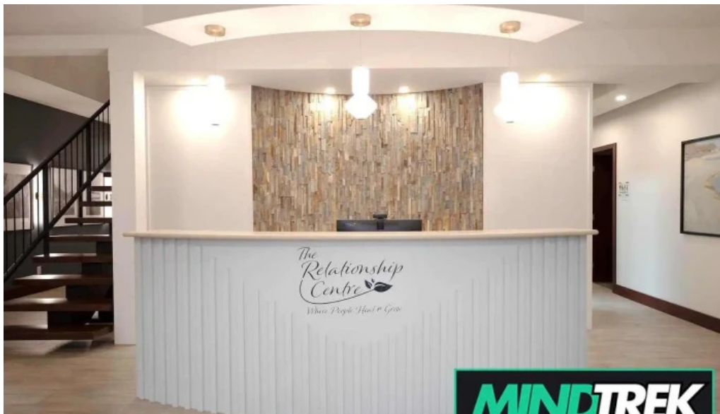
The relationship centre belleville