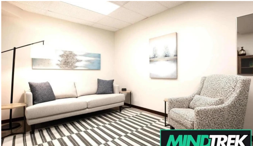
The relationship centre by owner