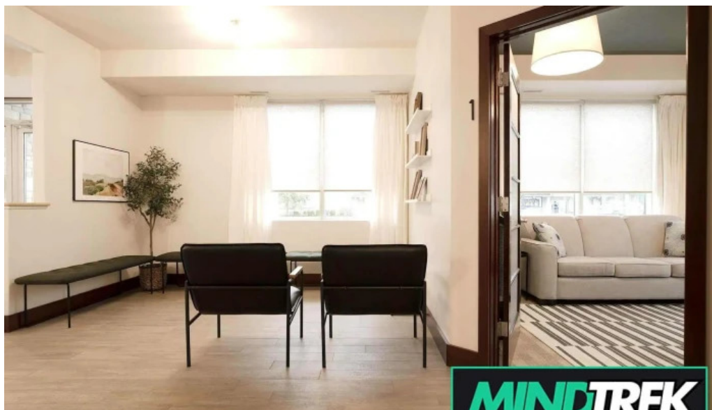
The relationship centre inside