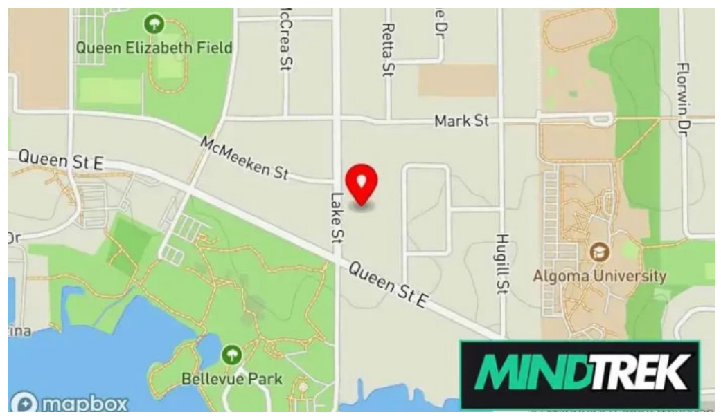
Anne oconnor map