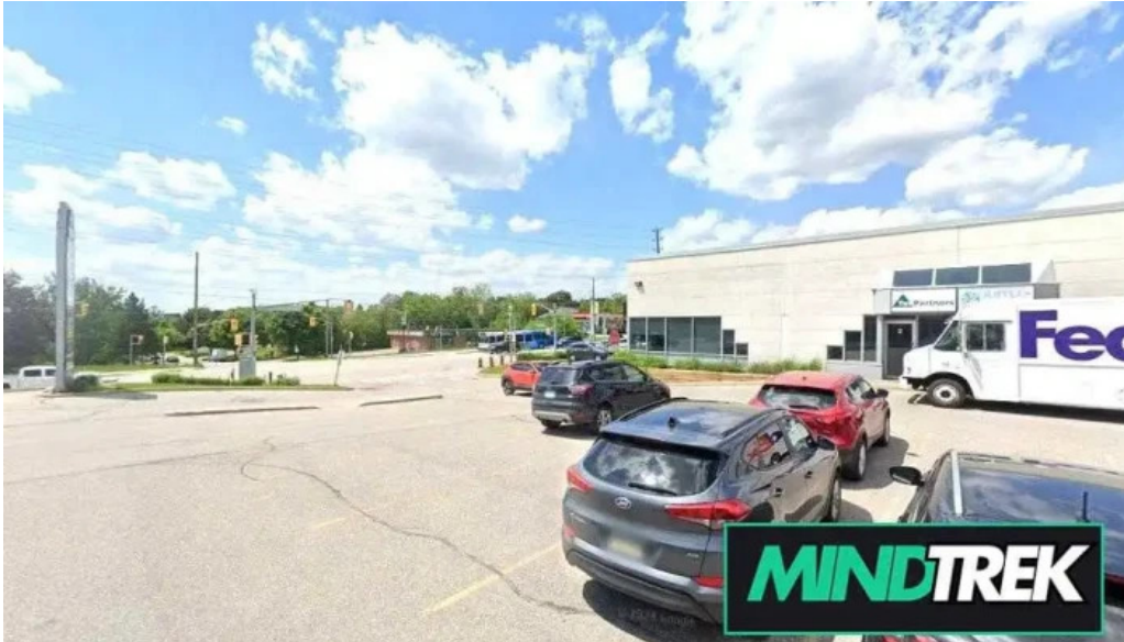
Lazowski b dr newmarket