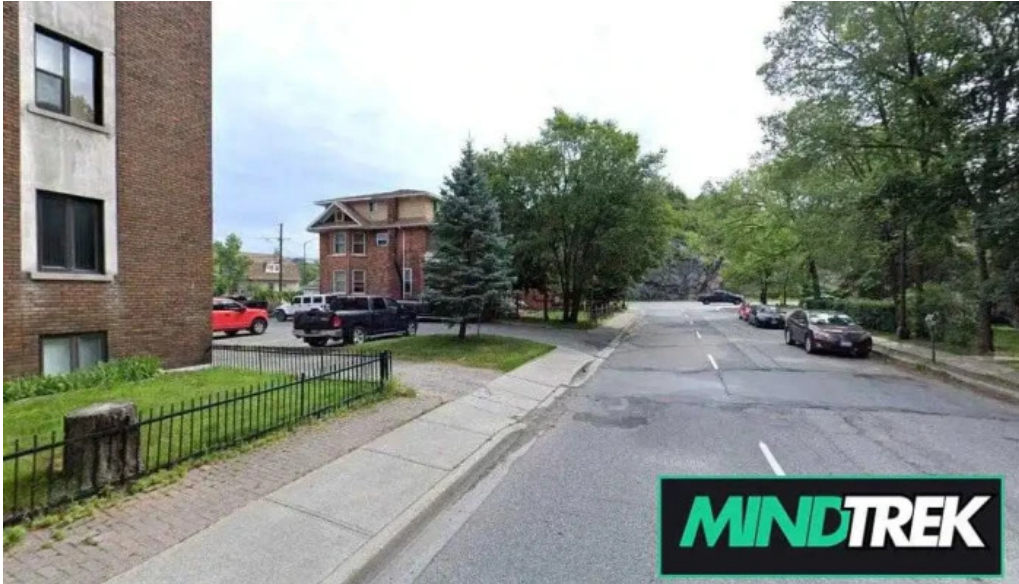
Caufield counselling and consulting greater sudbury