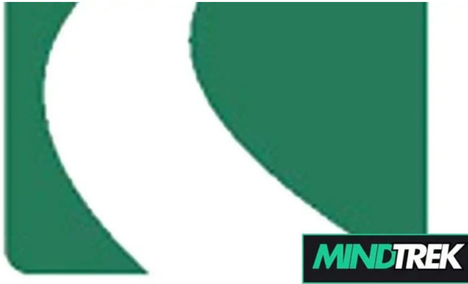
Caufield counselling and consulting by owner