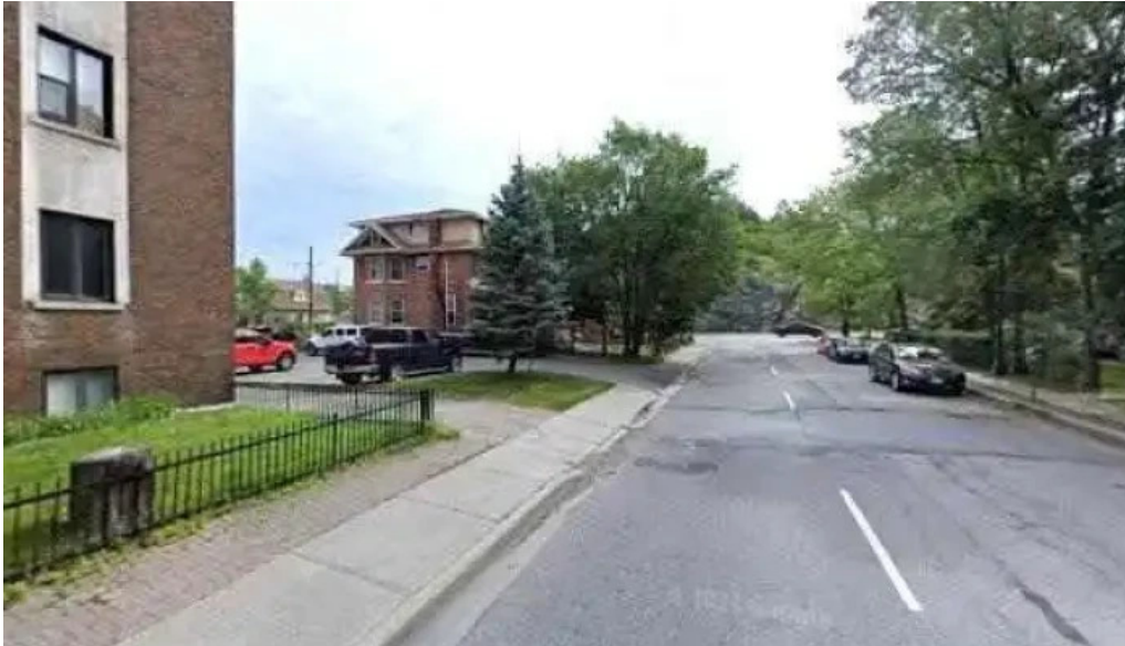
Caufield counselling and consulting all