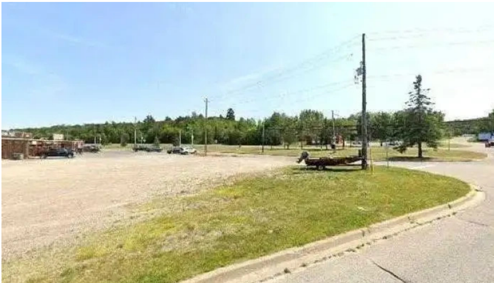
Counselling centre of east algoma street view 360deg