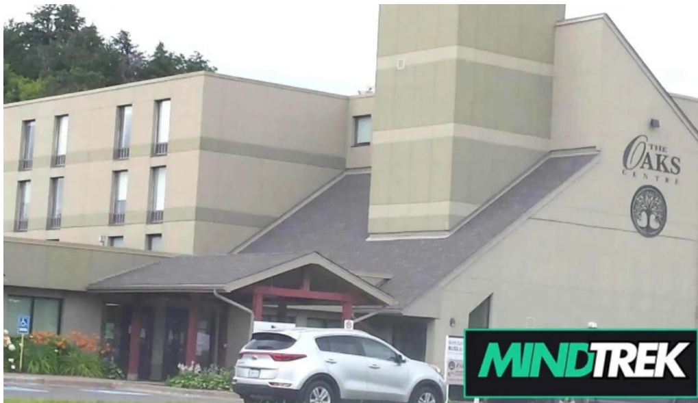
Counselling centre of east algoma elliot lake