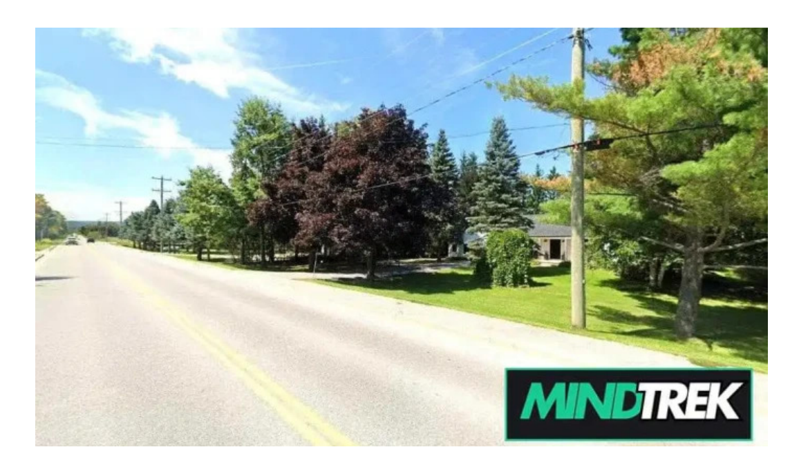
Family Counselor In Collingwood