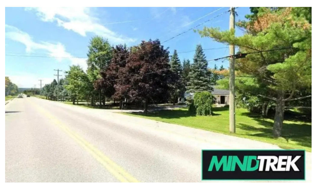
Muriel wilde collingwood