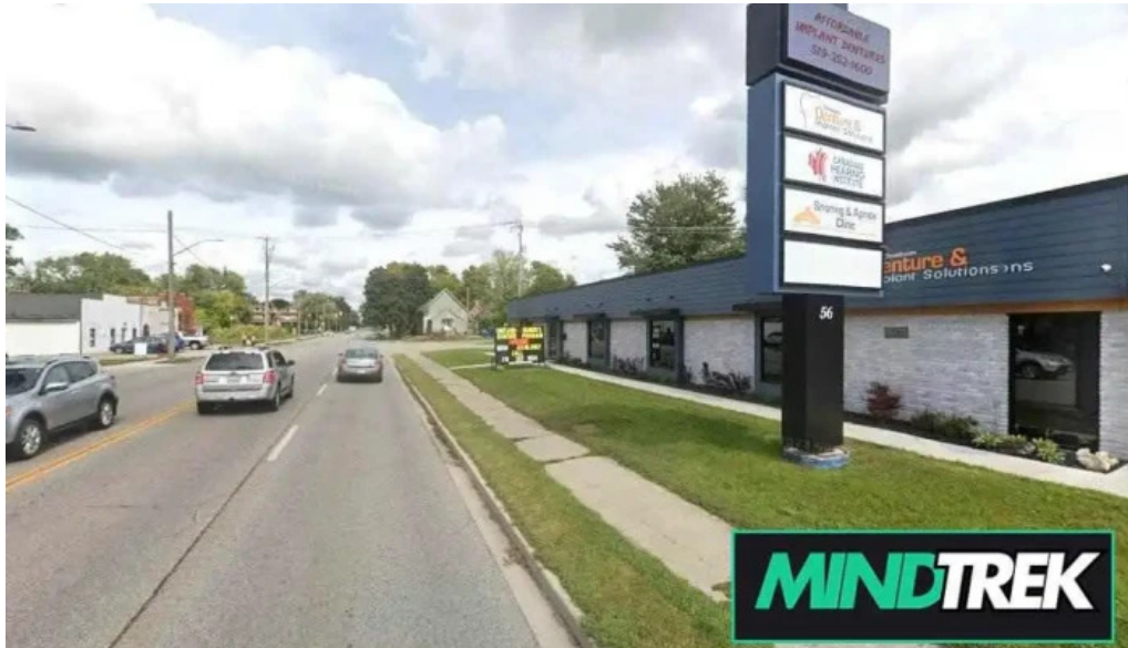
Caring counselling provided chatham