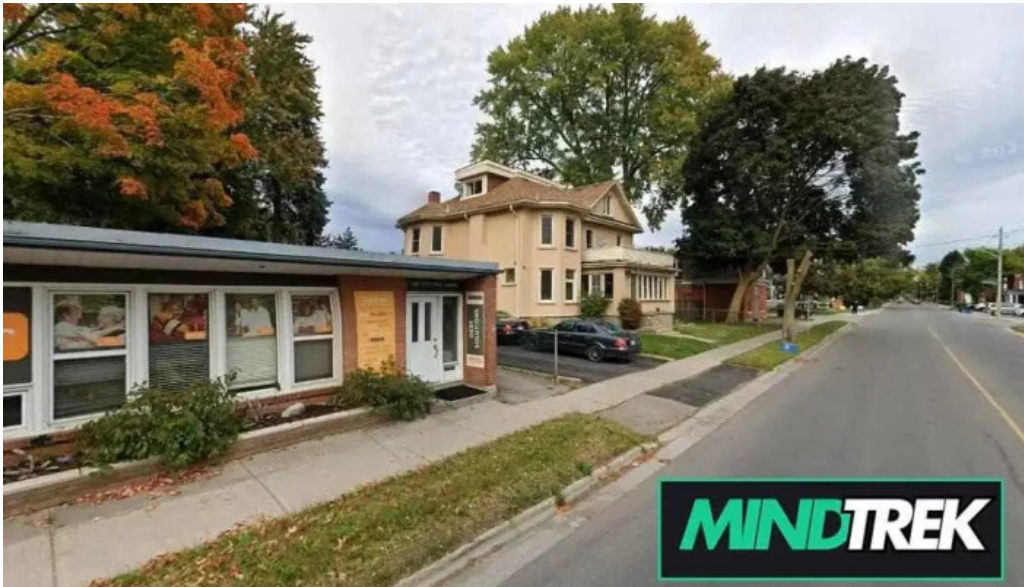
Victoria avenue counselling mediation centre belleville