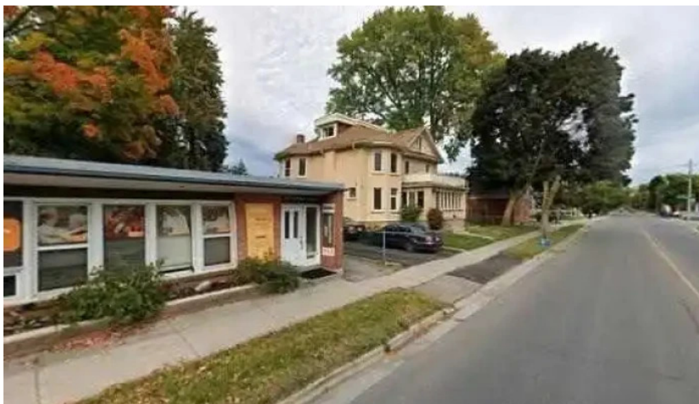
Victoria avenue counselling mediation centre all