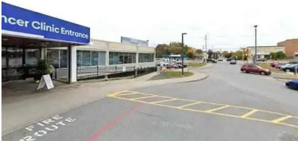
Crisis intervention centre all