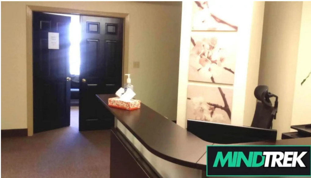
Reflections counselling and psychotherapy services inside