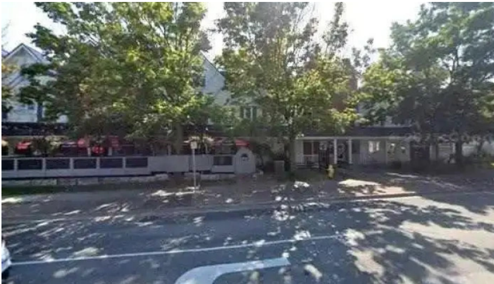
Reflections counselling and psychotherapy services street view 360deg