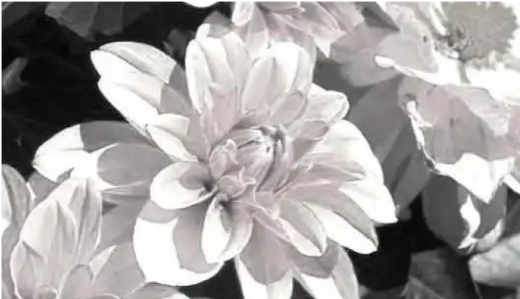
Reflections counselling and psychotherapy services whitby