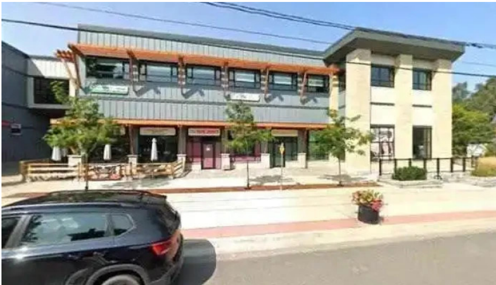
Its all about you therapy teen family grief trauma marriage counselling street view 360deg