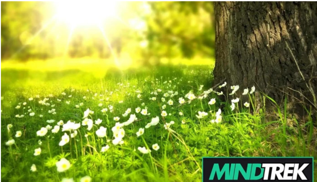
Its all about you therapy teen family grief trauma marriage counselling by owner