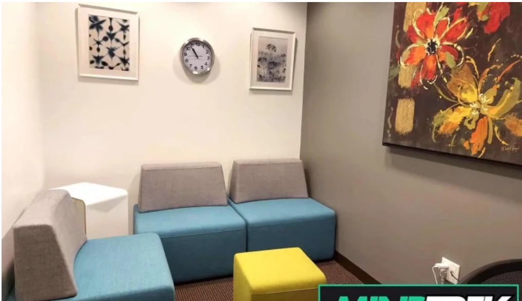
Forestgreen counselling services all