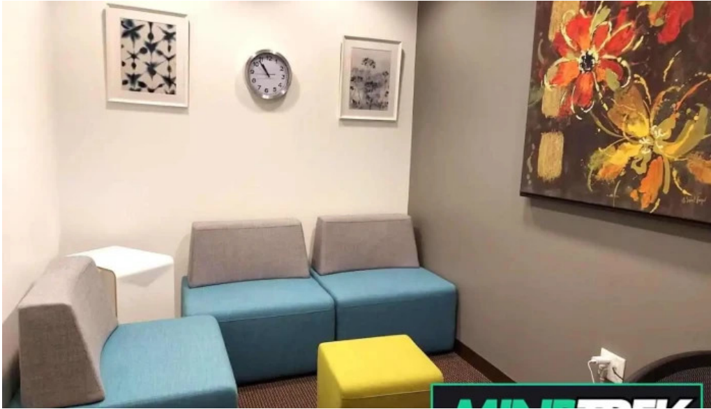
Forestgreen counselling services pickering