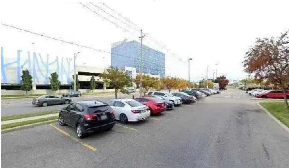
Forestgreen counselling services street view 360deg