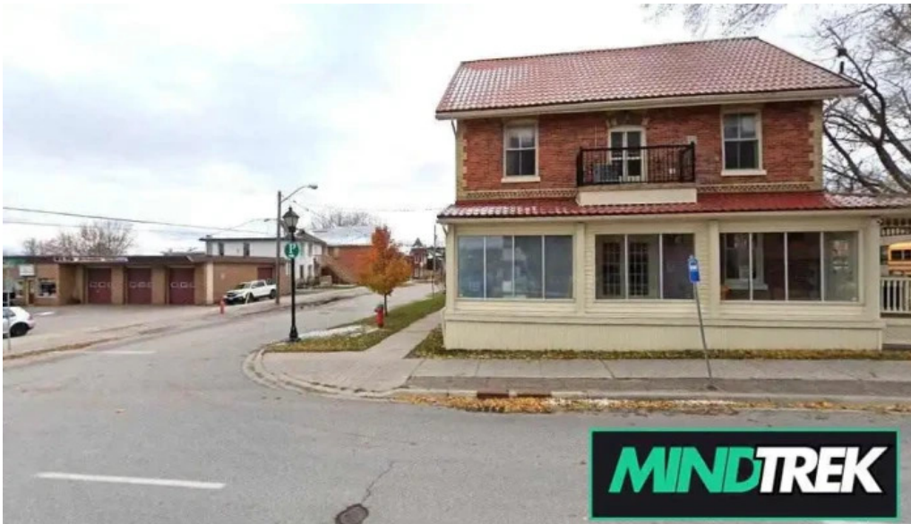
Evh counselling orillia