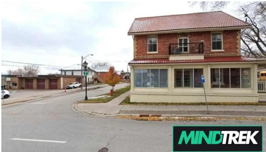
Brookside counselling orillia