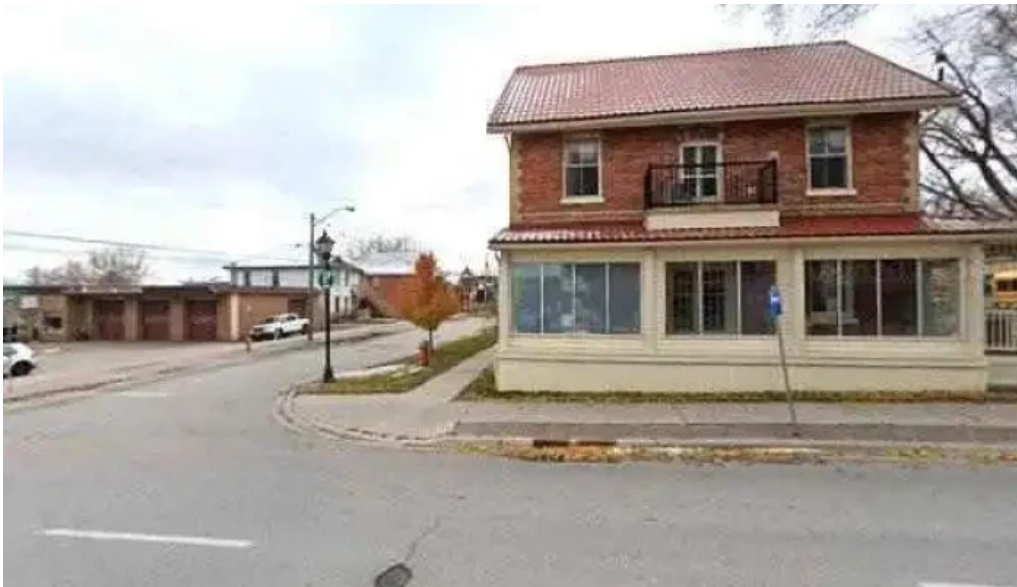
Brookside counselling all