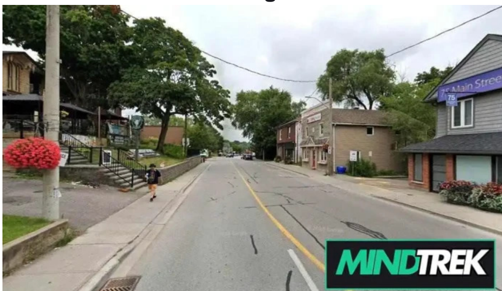
Blossom lives newmarket