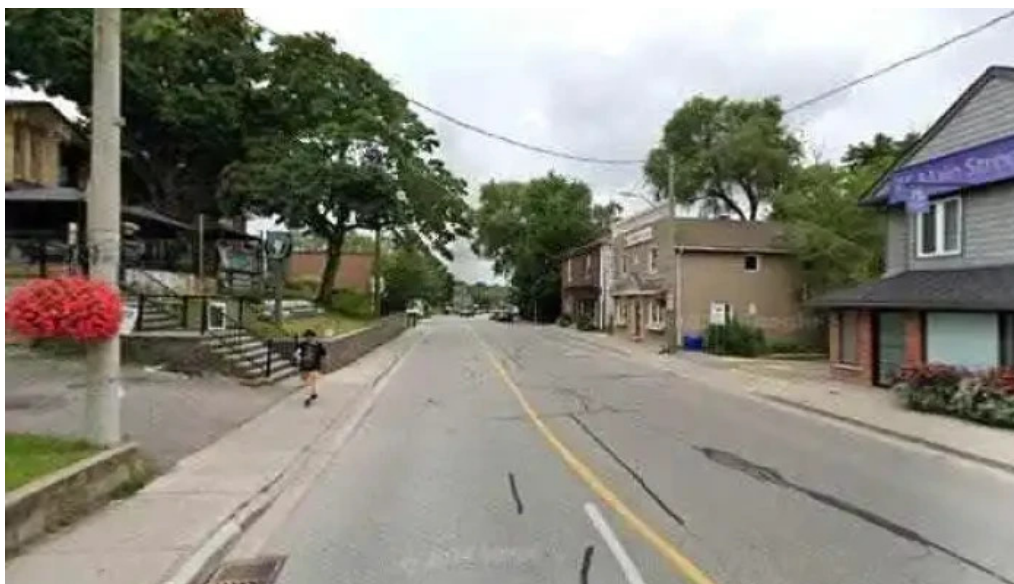
Blossom lives all