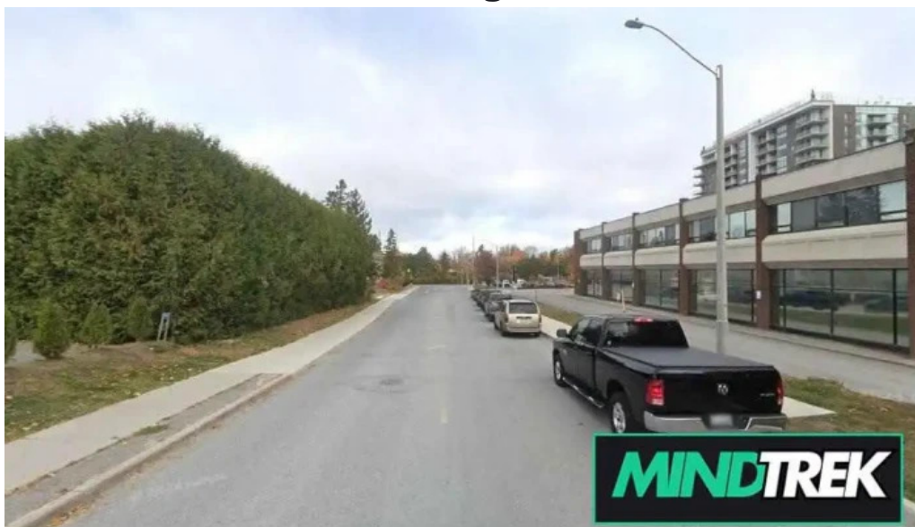
Mind movement therapy nepean