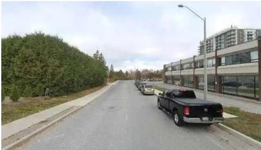
Mind movement therapy all