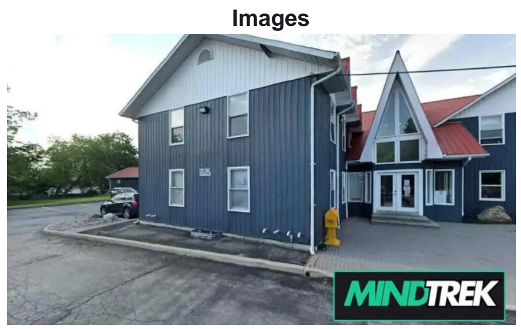
York region psychotherapy counselling services yrpcs keswick

If you wish to change any detail that you believe is not precise related to this web, please send us a message and we will fix it as soon as possible. Thank you in advance thanks.