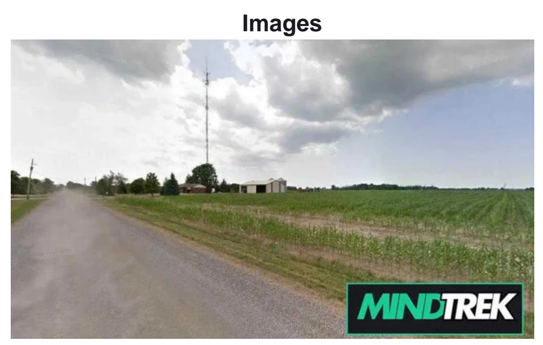
Interconnection equine assisted therapy chatham

If you require to update any detail that you believe is not accurate concerning this site, please forward a message so that we will handle it quickly. Thank you in advance thanks.