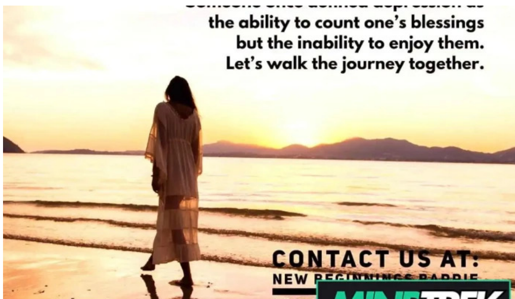
New beginnings barrie barrie