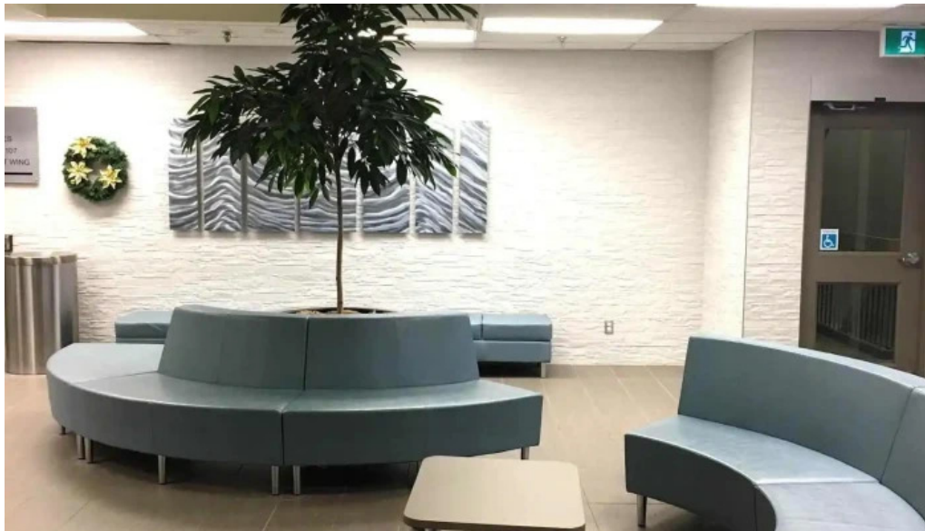
New beginnings barrie inside