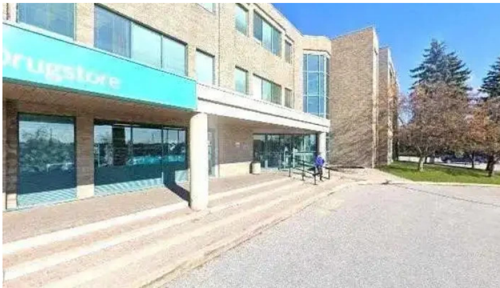
New beginnings barrie street view 360deg