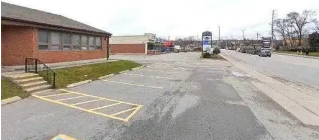
Cfs counselling wellbeing all