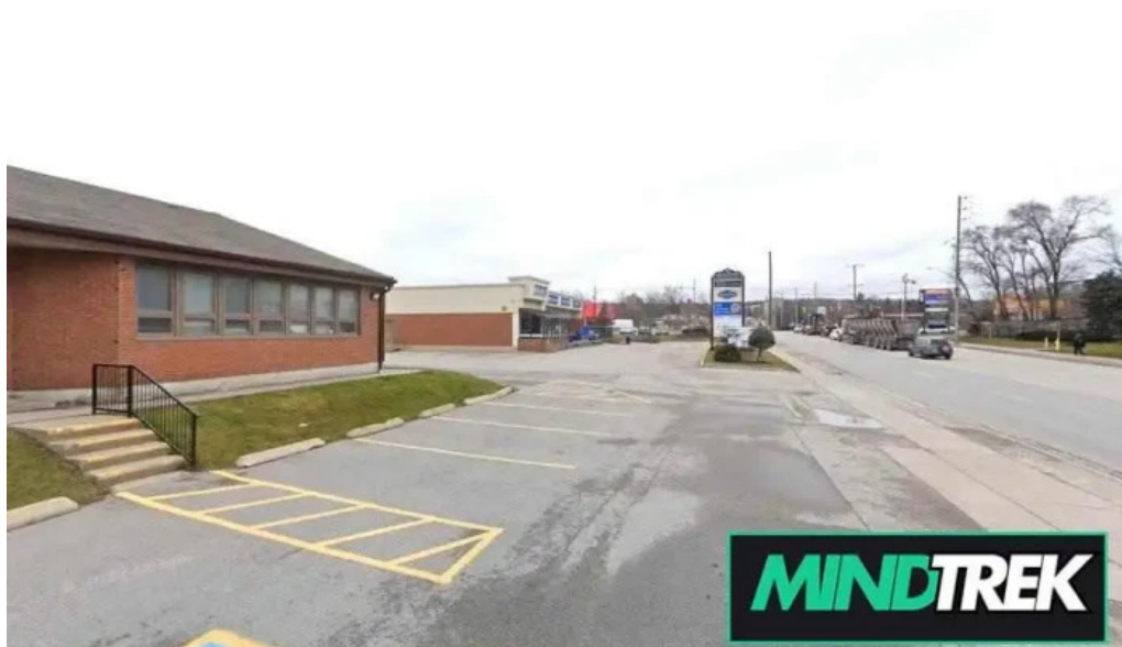
Cfs counselling wellbeing barrie