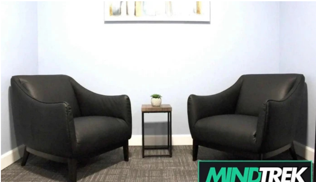
State of grace counselling and wellness alliston