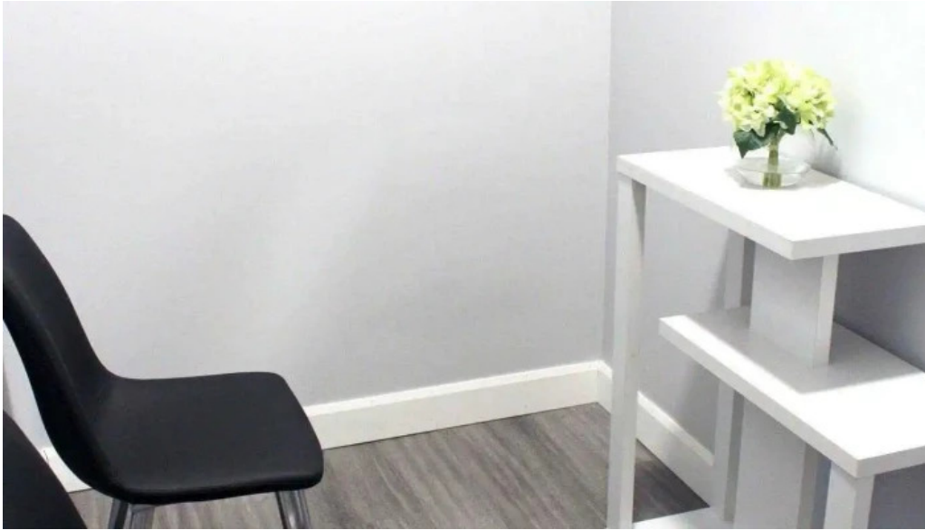
State of grace counselling and wellness by owner