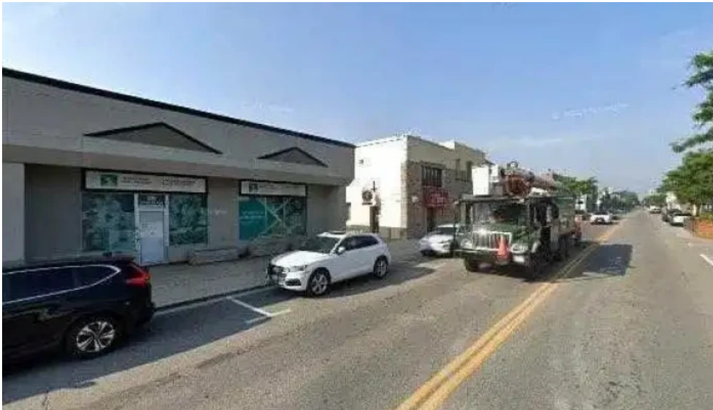
State of grace counselling and wellness street view 360deg