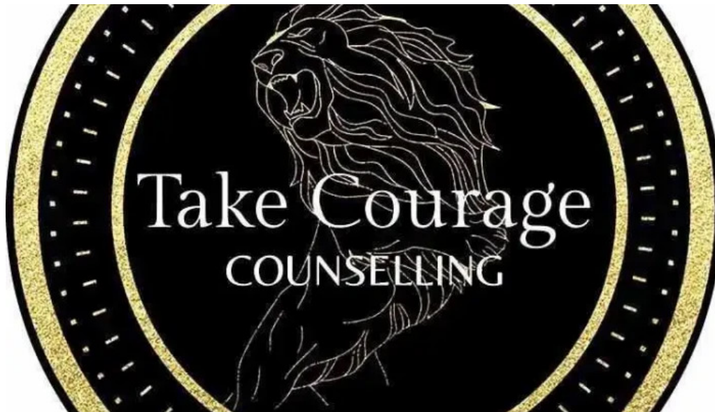
Take courage counselling ajax