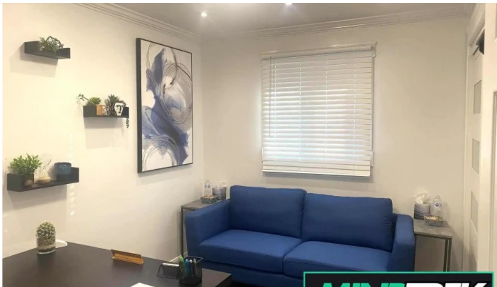
Take courage counselling by owner