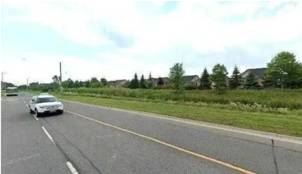
Take courage counselling street view 360deg