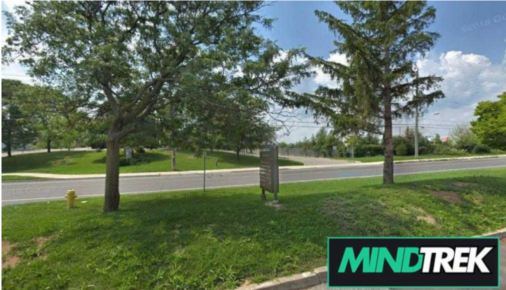
Psychotherapy works ajax