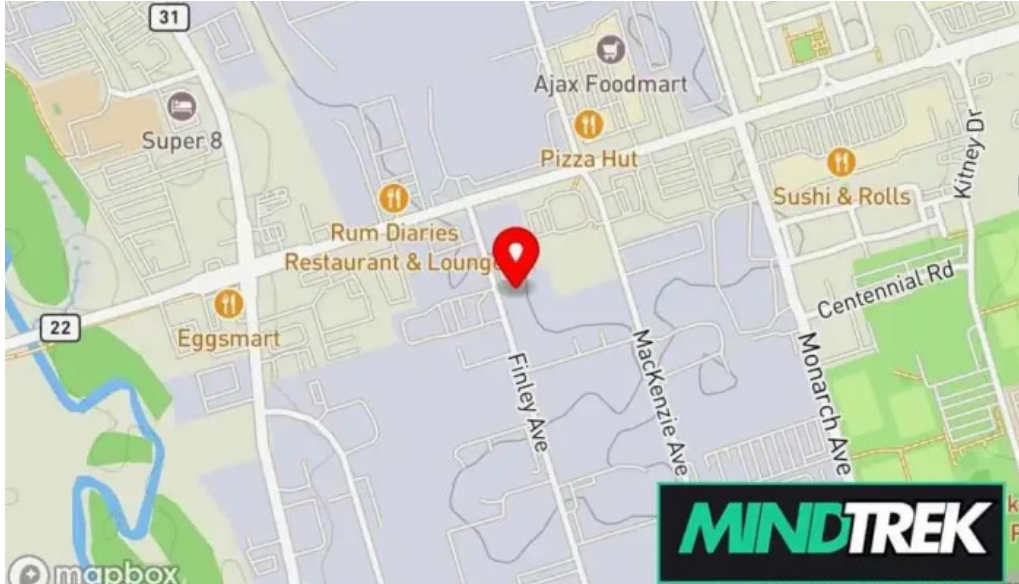
Psychotherapy works map