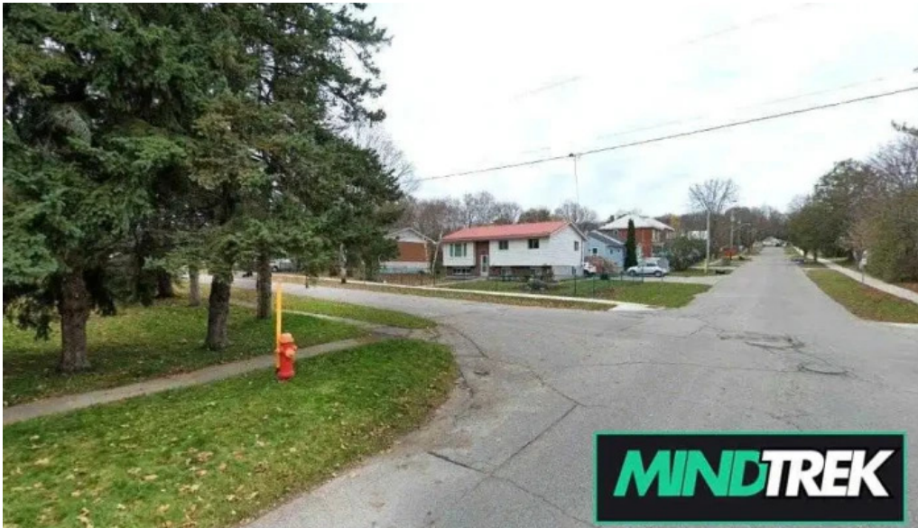
Cbt therapy center orillia