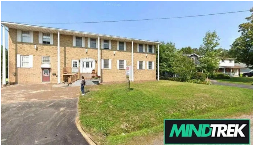
Brenna lanktree associates inc behavioural therapy consultation sault ste marie