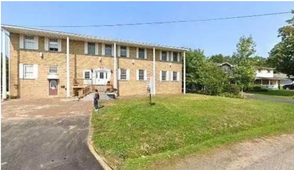
Brenna Lanktree Associates Inc. behavioural therapy consultation all