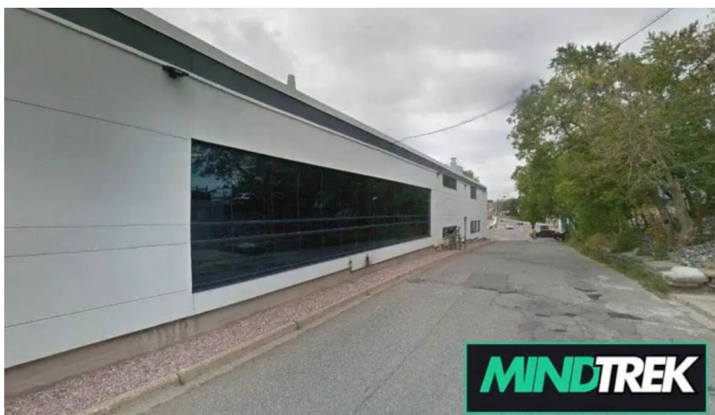
Compass boussole akii izhinoogan greater sudbury