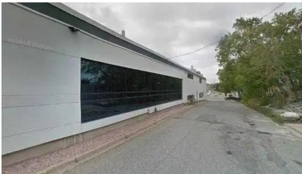
Compass boussole akii izhinoogan all