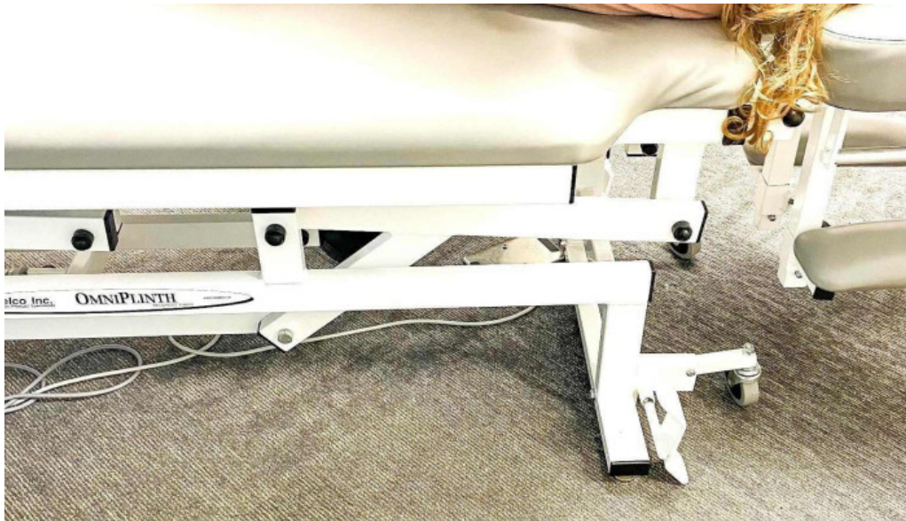
Miller health medical treatment