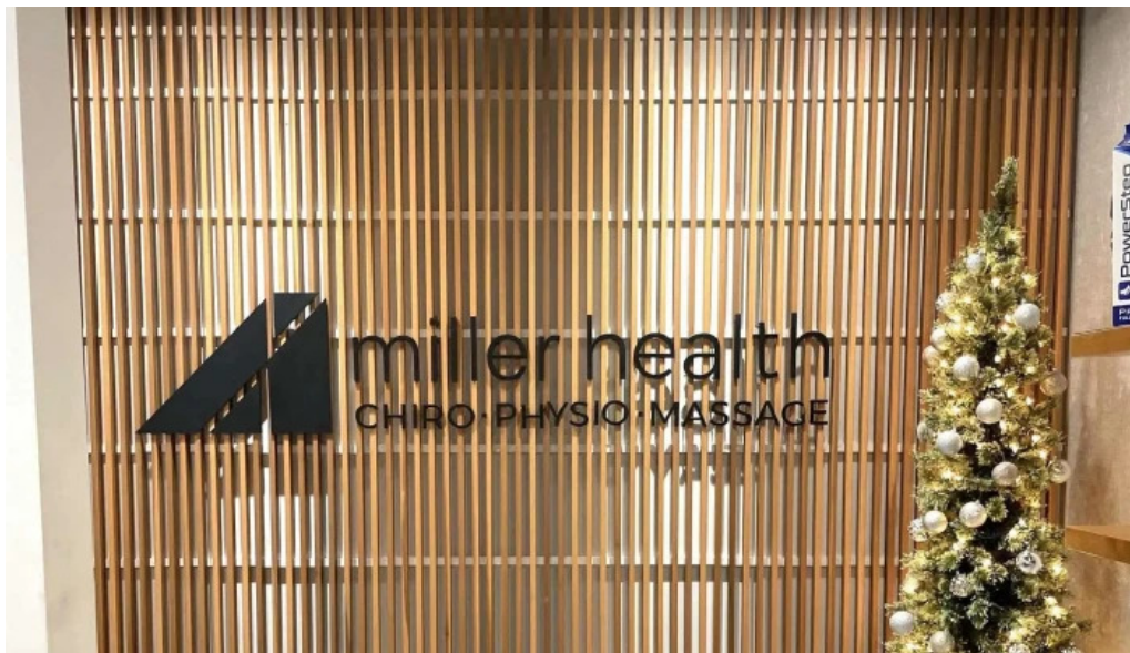
Miller health chiropractor