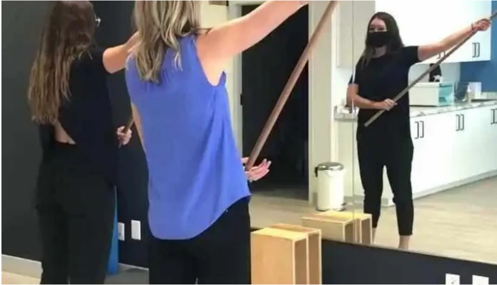
Miller health videos