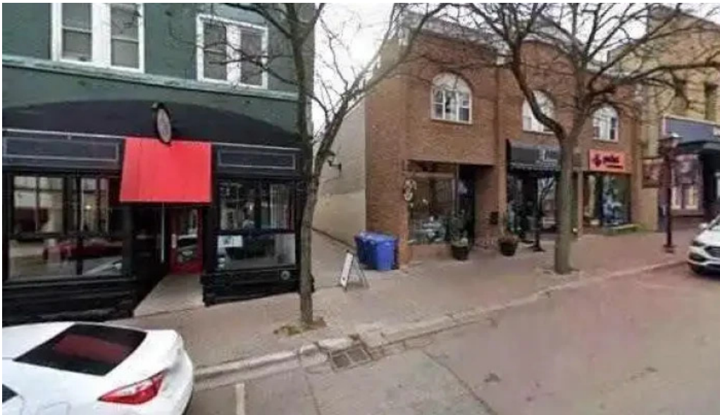
Miller health street view 360deg