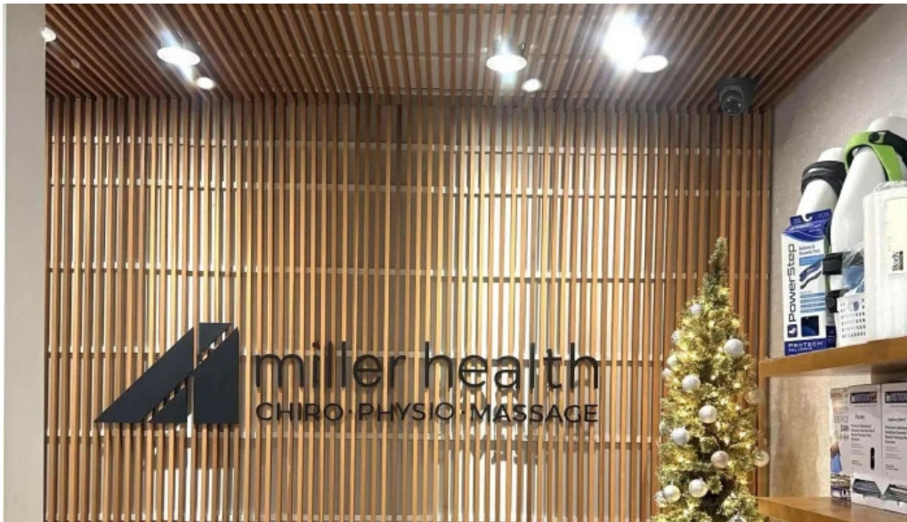
Miller health prices