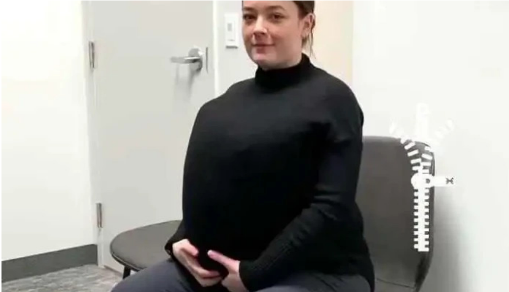
Miller health by owner