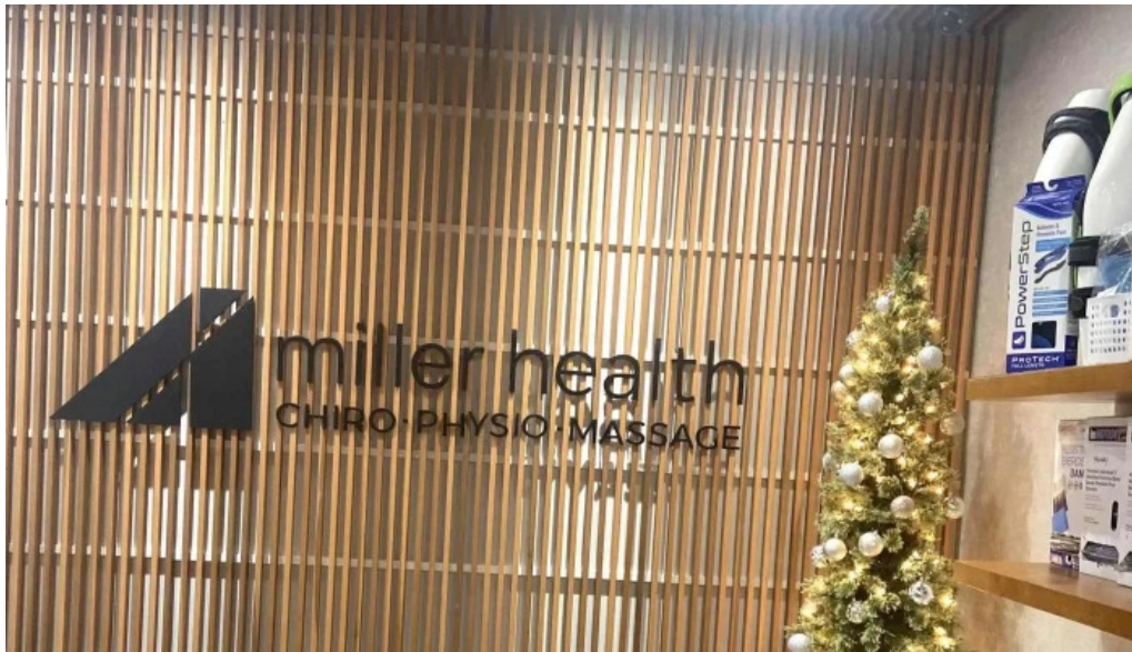
Miller health instagram