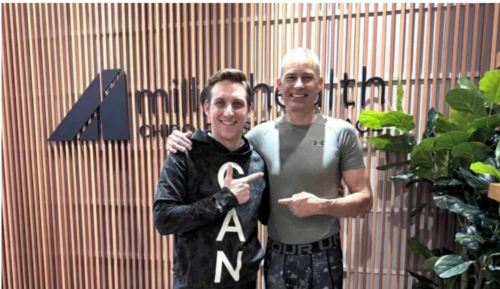
Miller health orillia