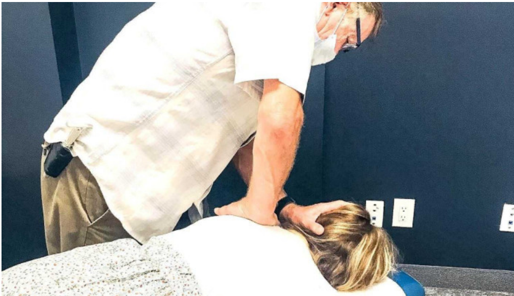
Miller health all