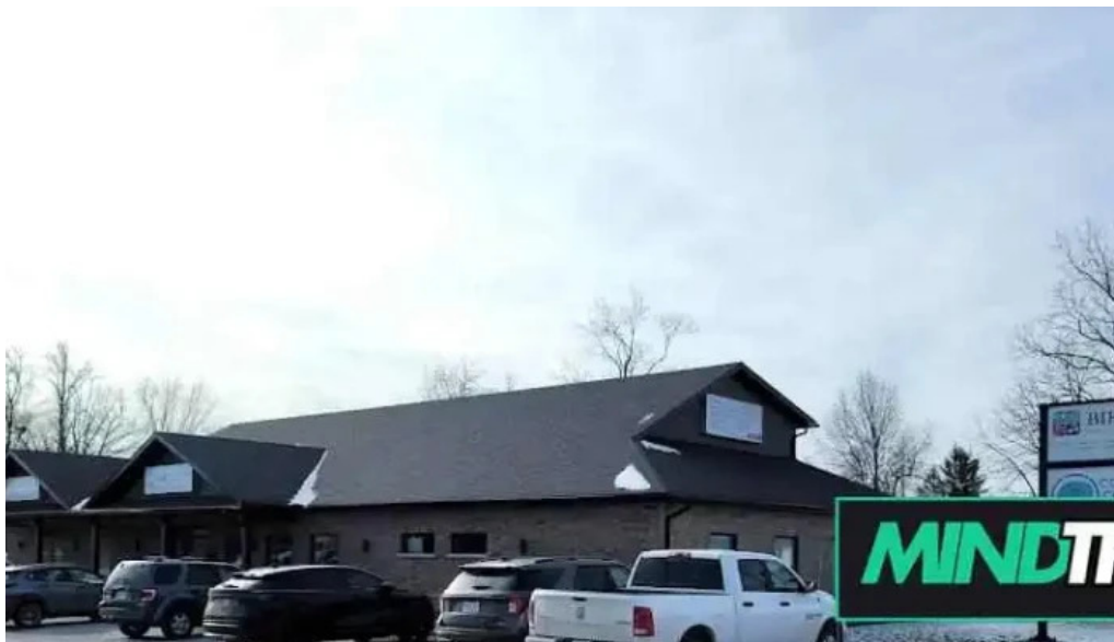
Belleville integrative health centre by owner