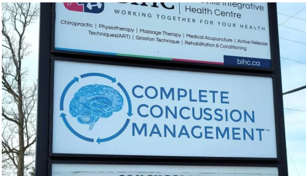
Belleville integrative health centre address