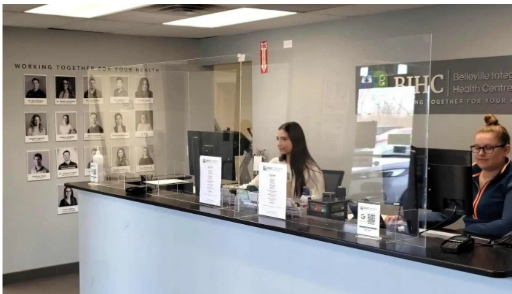
Belleville integrative health centre belleville