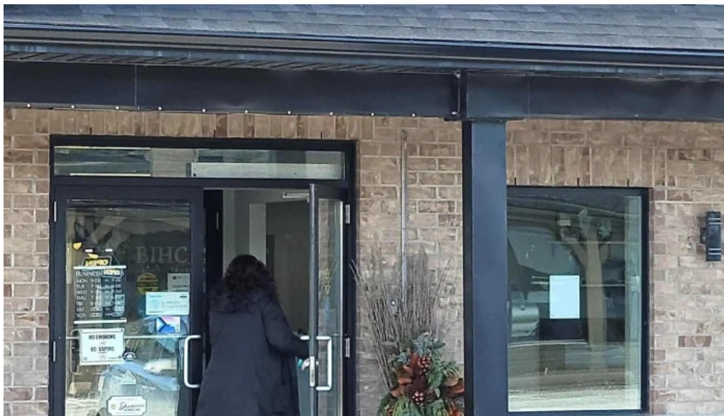
Belleville integrative health centre chiropractor