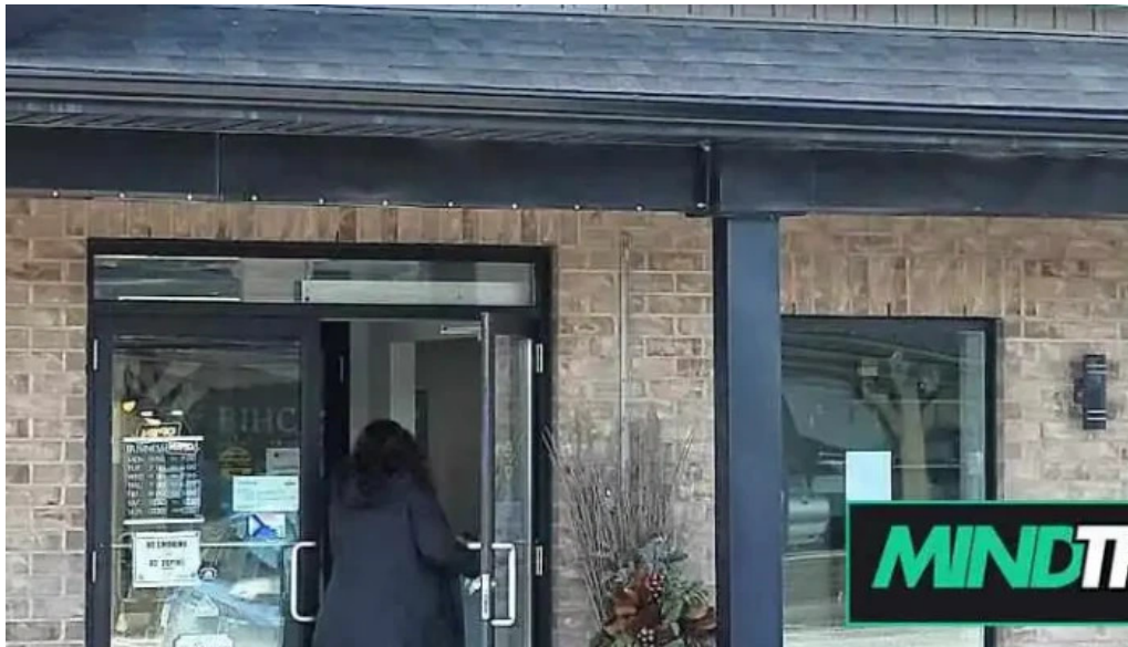
Belleville integrative health centre all