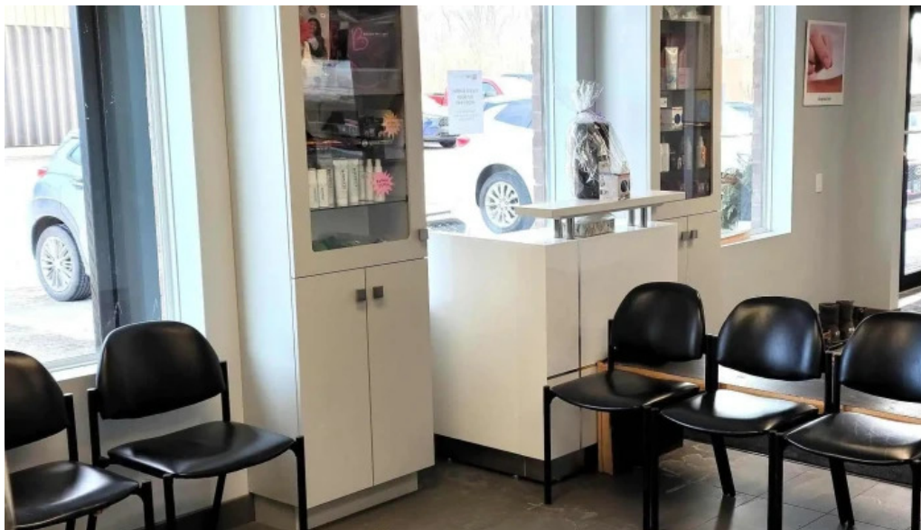
Belleville integrative health centre number