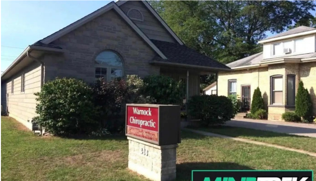
Aylmer chiropractic office aylmer