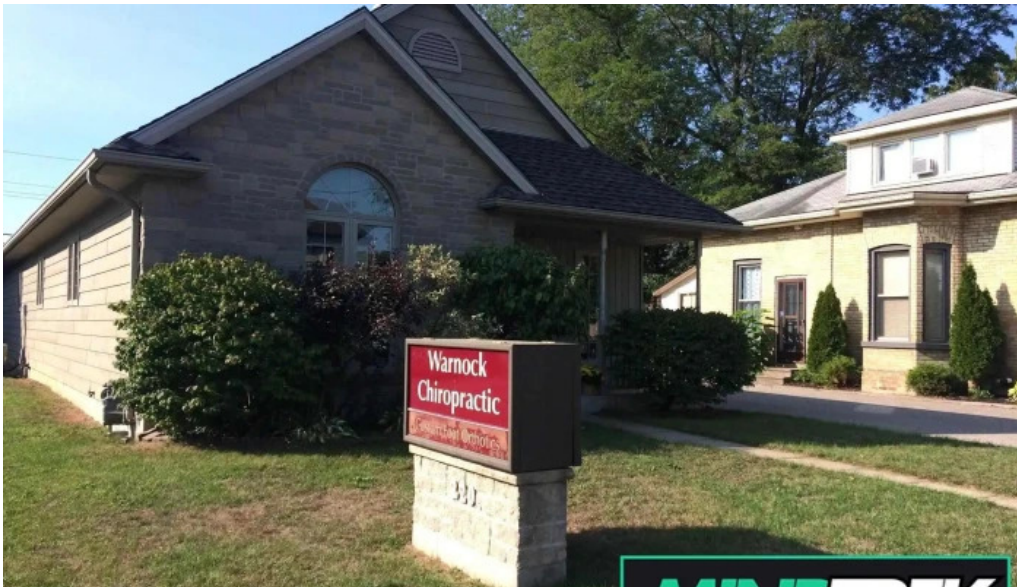
Aylmer chiropractic office all