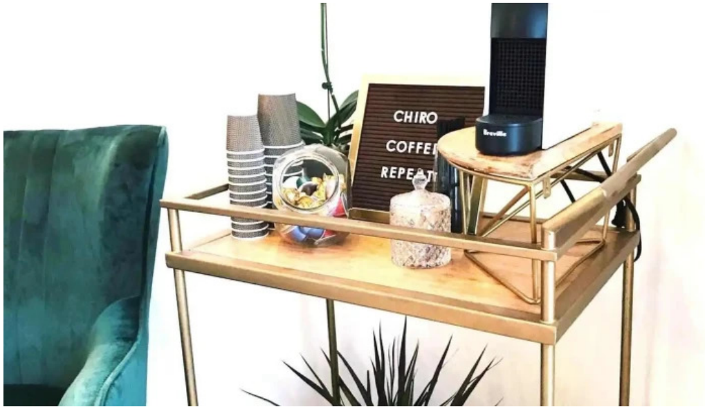
240 performance care centre by owner