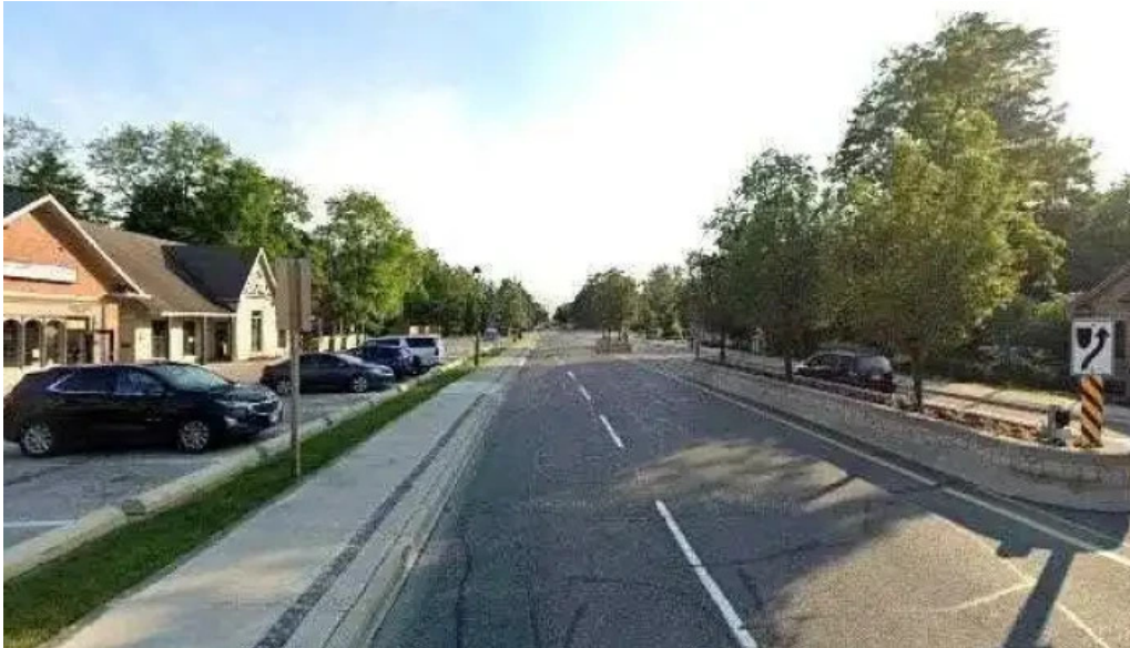
240 performance care centre street view 360deg