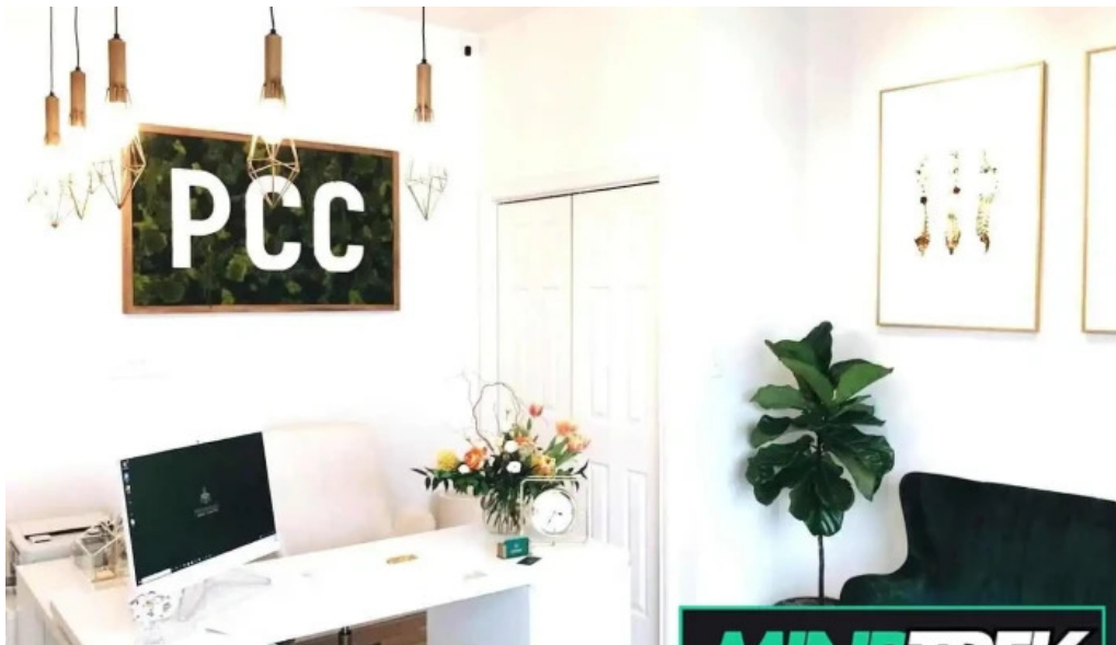
240 performance care centre ancaster