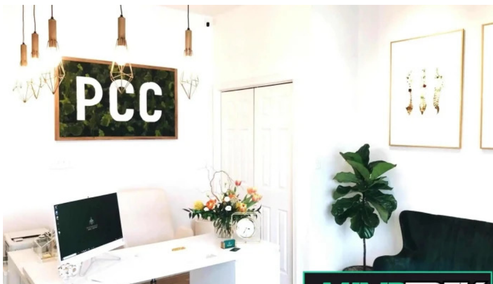
240 performance care centre all