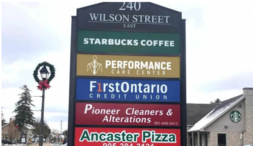
240 performance care centre chiropractor