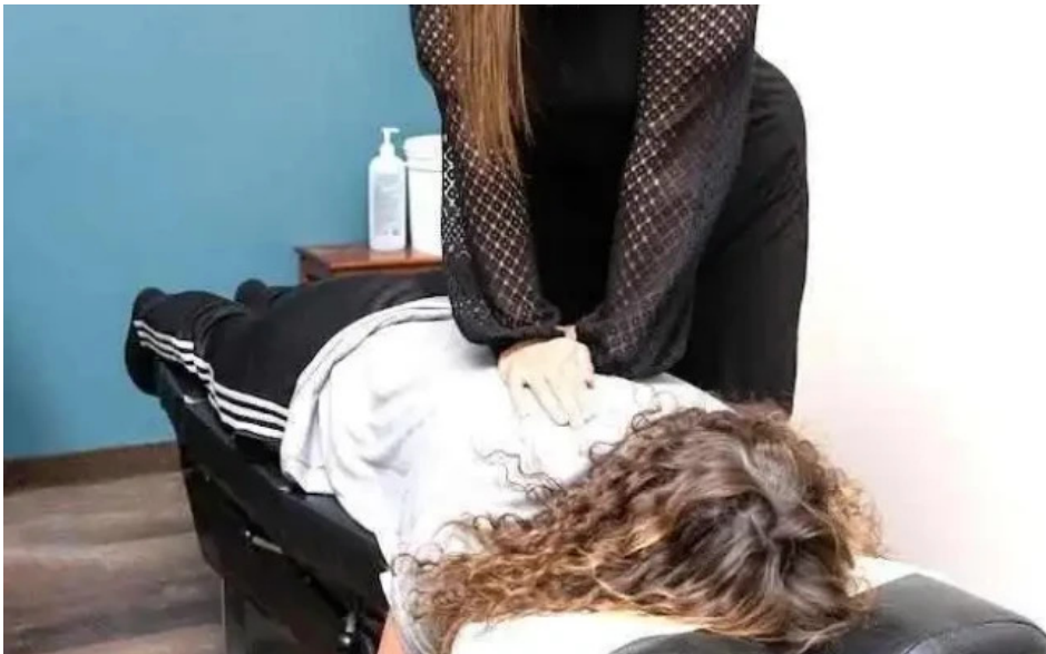
Unique family chiropractic wellness centre ajax