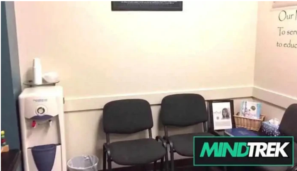
Unique family chiropractic wellness centre videos