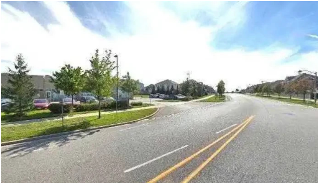
Unique family chiropractic wellness centre street view 360deg