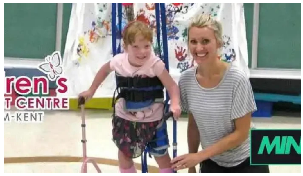
Children's treatment centre of chatham kent chatham