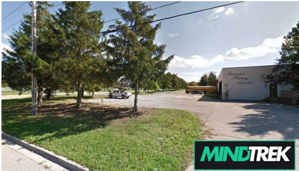
Winds of change therapeutic services cambridge