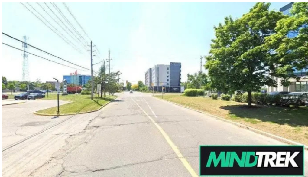
Canadian counselling and psychotherapy association nepean