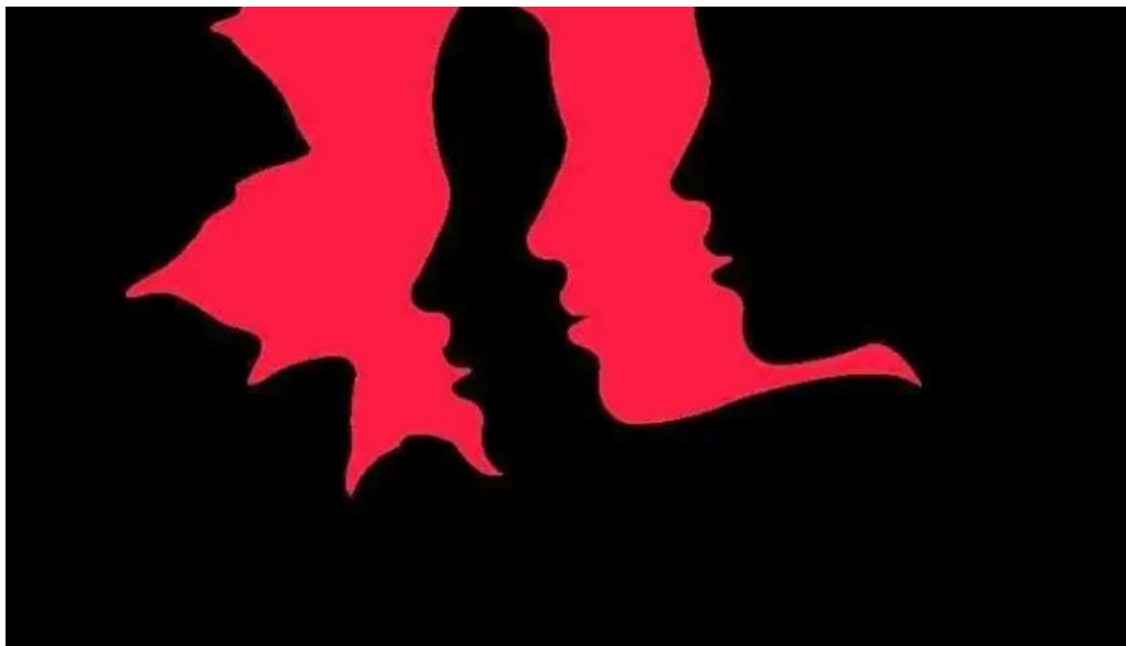
Canadian counselling and psychotherapy association by owner