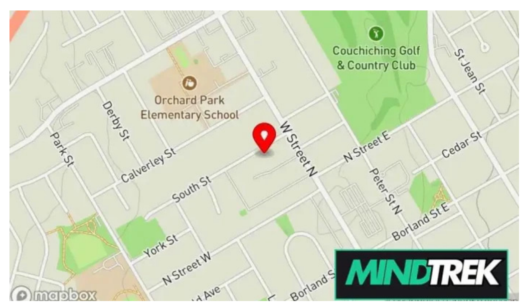
Seven south street treatment centre map