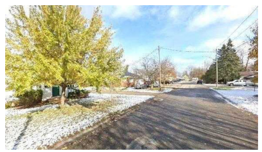
Seven south street treatment centre all