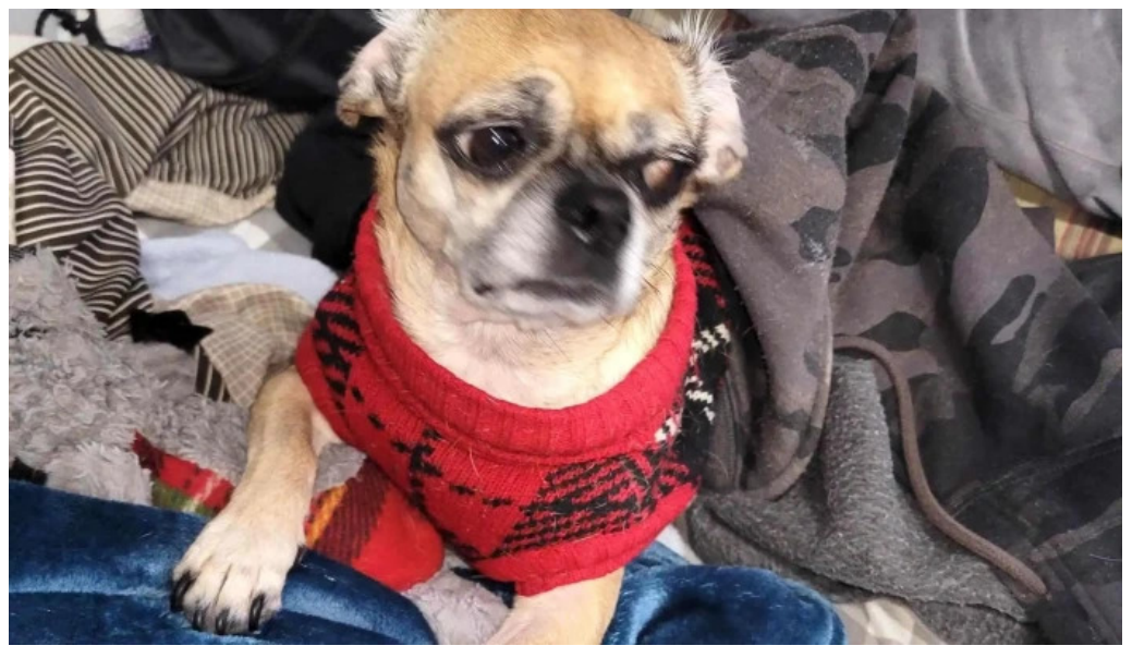
Seven south street treatment centre addiction treatment center