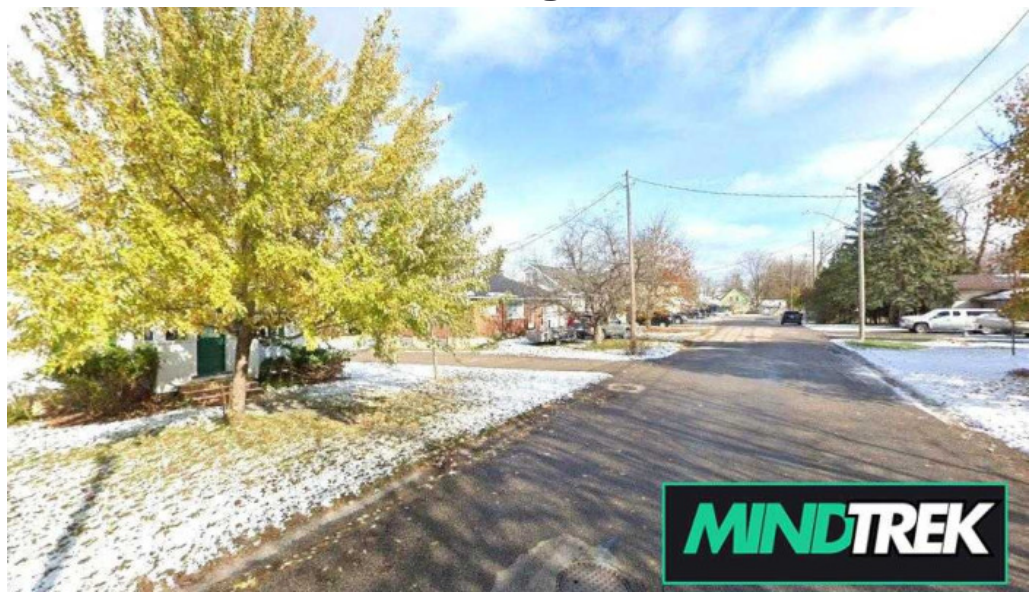
Seven south street treatment centre orillia