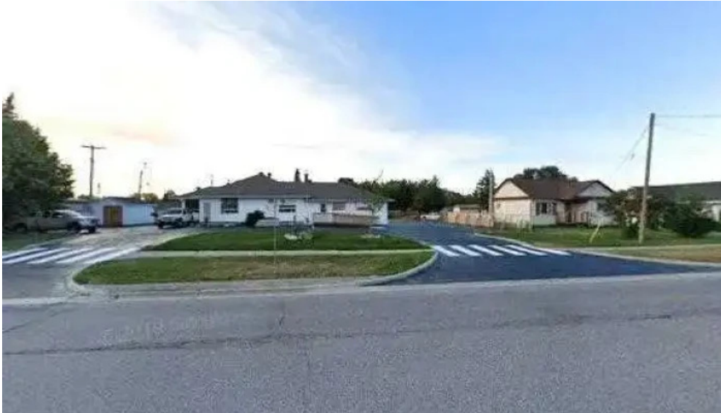
Be well acupuncture wellness clinic street view 360deg