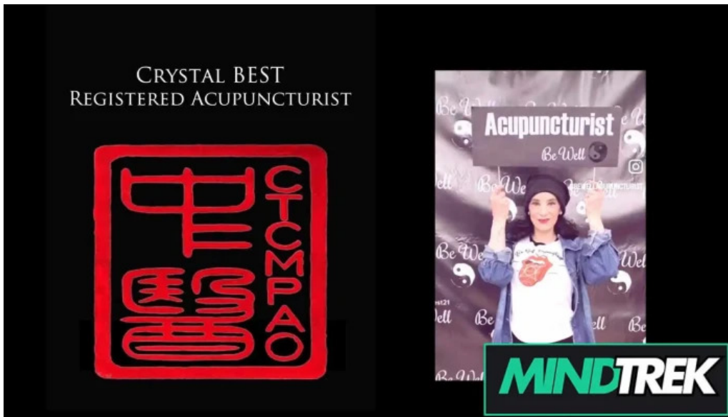
Be well acupuncture wellness clinic by owner