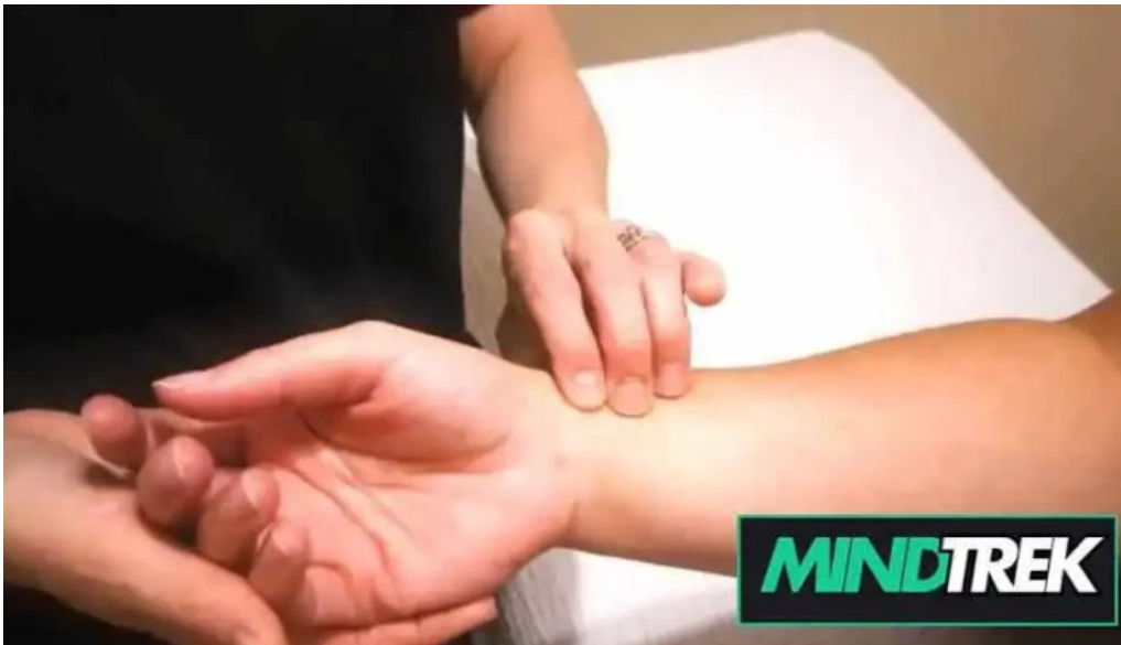
Be well acupuncture wellness clinic azilda